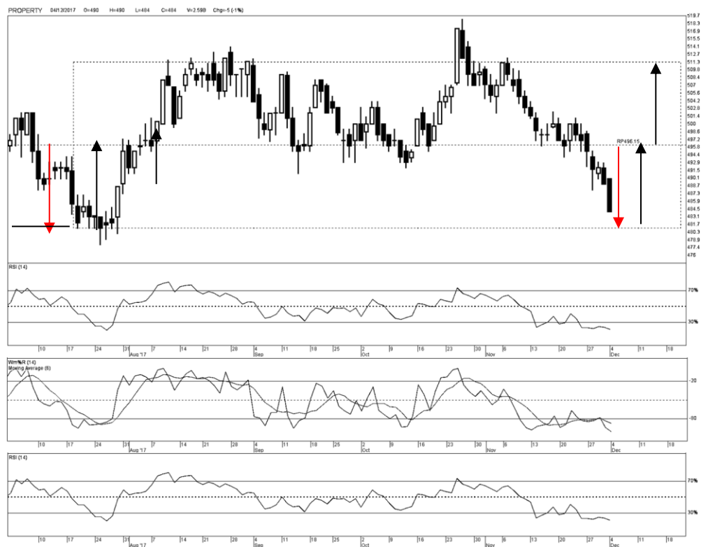
Kinerja sektor properti